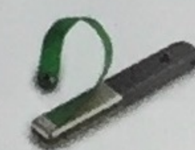
GOTENNA PHONE BOOSTER

Click the button of the Big Agnes "mtn-GLO" tent to turn on LEDs sewn into the ceiling and walls, or retrofit an old tent with a clip-on kit.