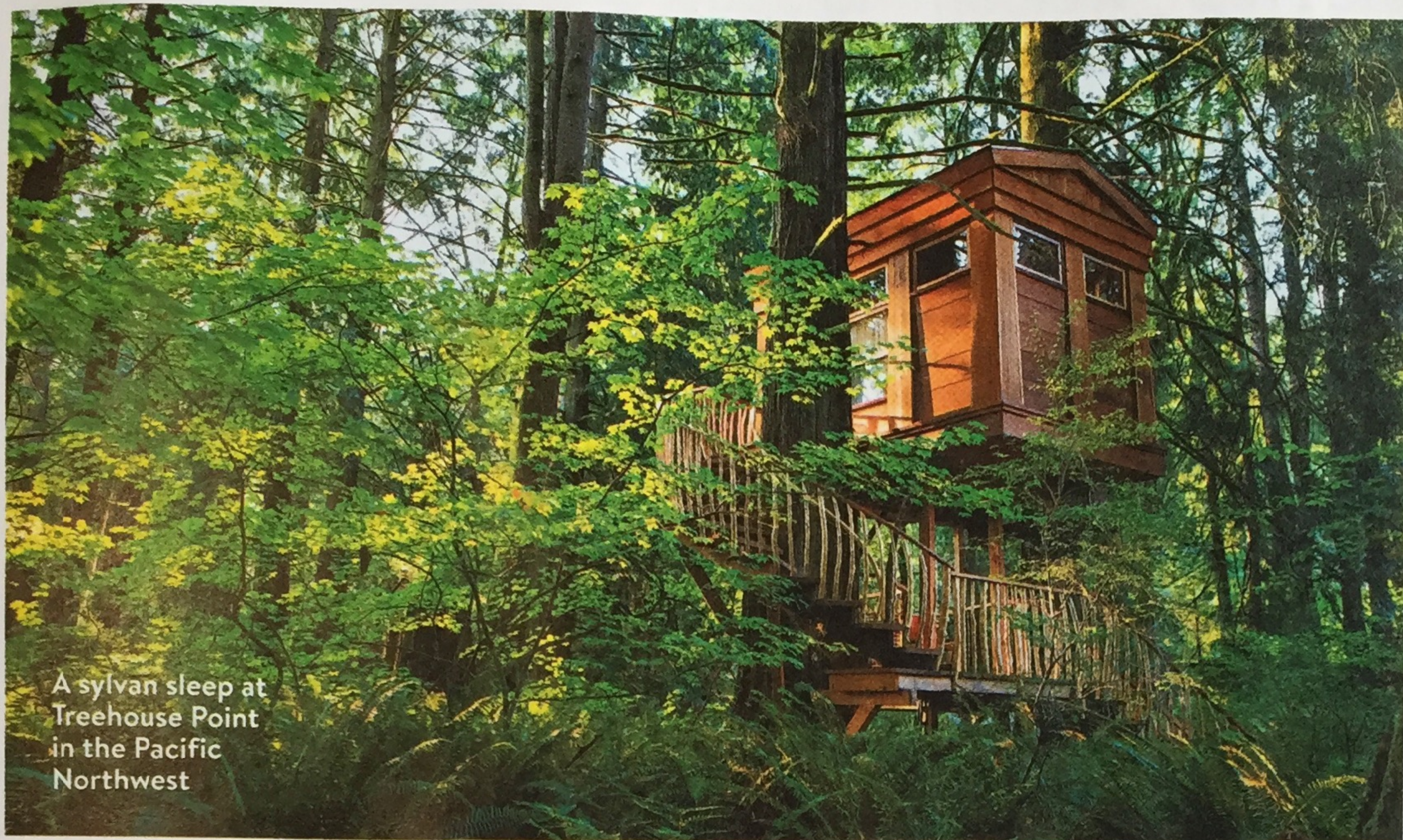
A sylvan sleep at Treehouse Point in the Pacific Northwest