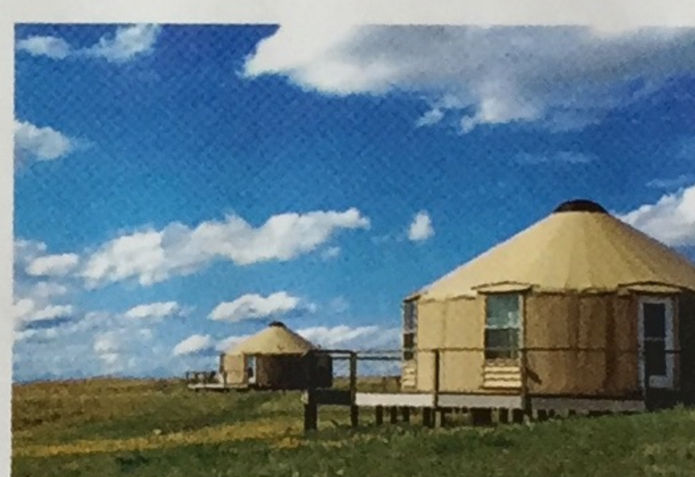
KESTREL CAMP MISSOURI BREAKS, MONTANA

Backdrop: Adirondack Park, a recreation wonderland of six million acres filled with forests, lakes, and mountains. Best for: Multigenerational families with high-energy tots and teens. Creature comforts: Cozy family cabins, adults-only lodge rooms, and bungalows located on the shores of Blue Mountain Lake. Get busy: Kayak, swim, canoe, fish, and cannonball off the dock; nightly bonfires with s'mores and weekly bingo are fun at any age. From $215, including breakfast and dinner.