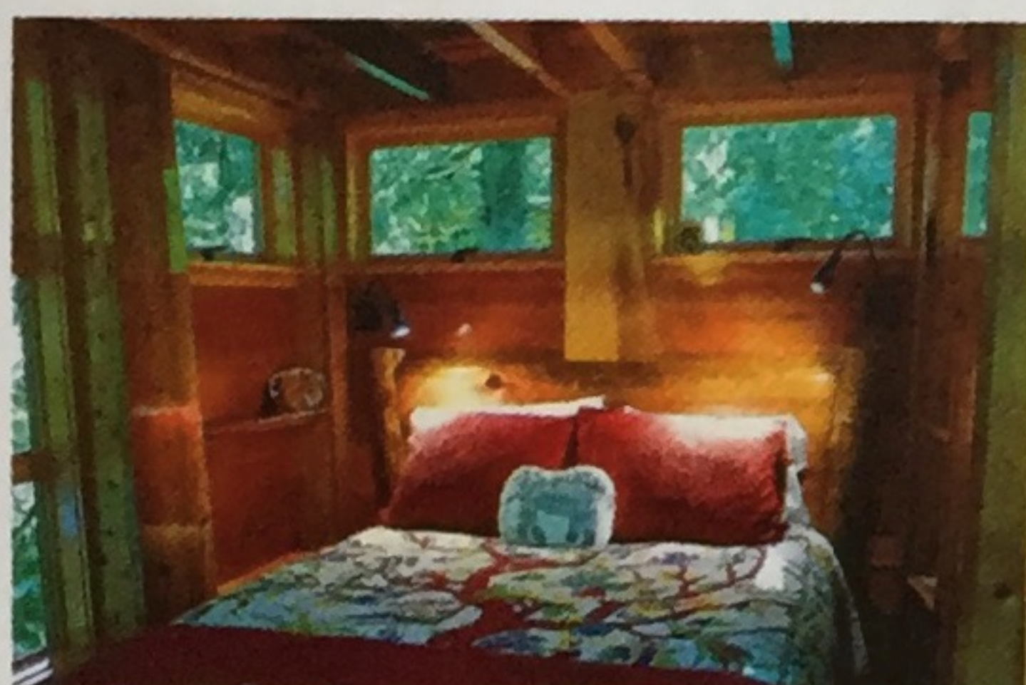
TREEHOUSE POINT B&B FALL CITY, WASHINGTON

Lodge in nature without sacrificing comfort