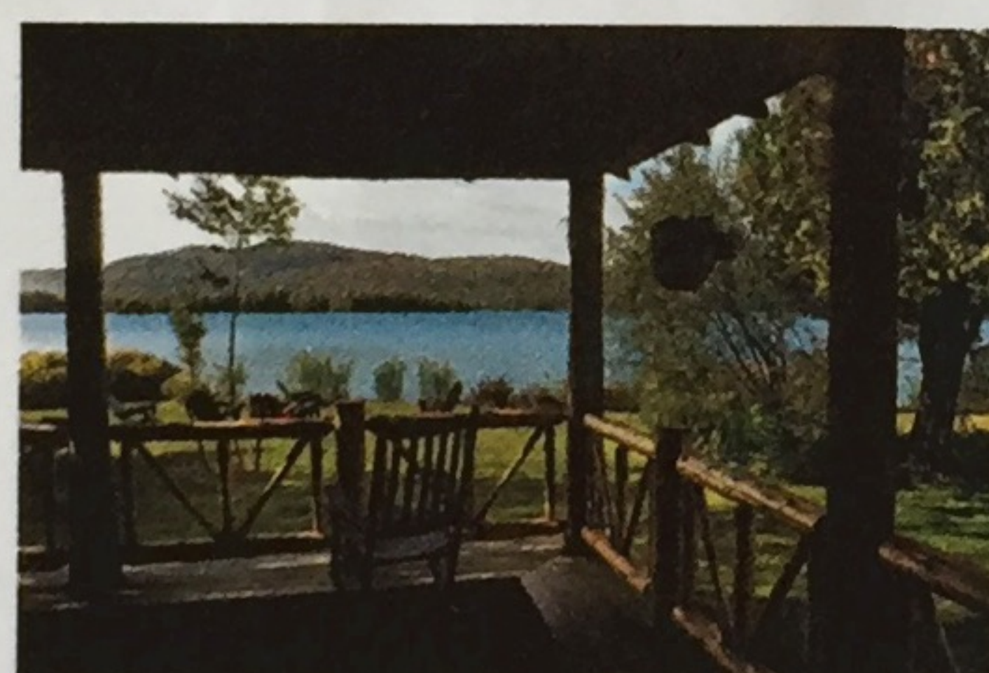
THE HEDGES BLUE MOUNTAIN LAKE, NEW YORK

Backdrop: The western foothills of the Cascade Mountains, beside the Raging River. Best for: Couples seeking lofty hideaways and Wi-Fi-free nights. Creature comforts: Six hand-built wooden tree houses with quilt-covered beds, large windows, and porches; breakfast of eggs, homemade granola, breads, and fresh juice served in the main house. Get busy: Scenic Snoqualmie Falls and surrounding hiking paths are ten minutes away. From $255 (two-night minimum).