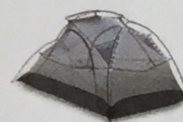
BIG AGNES TENT

This icebox on wheels brings the party with a blender, Bluetooth speakers, LED lid light, USB charger, and a built-in bottle opener.