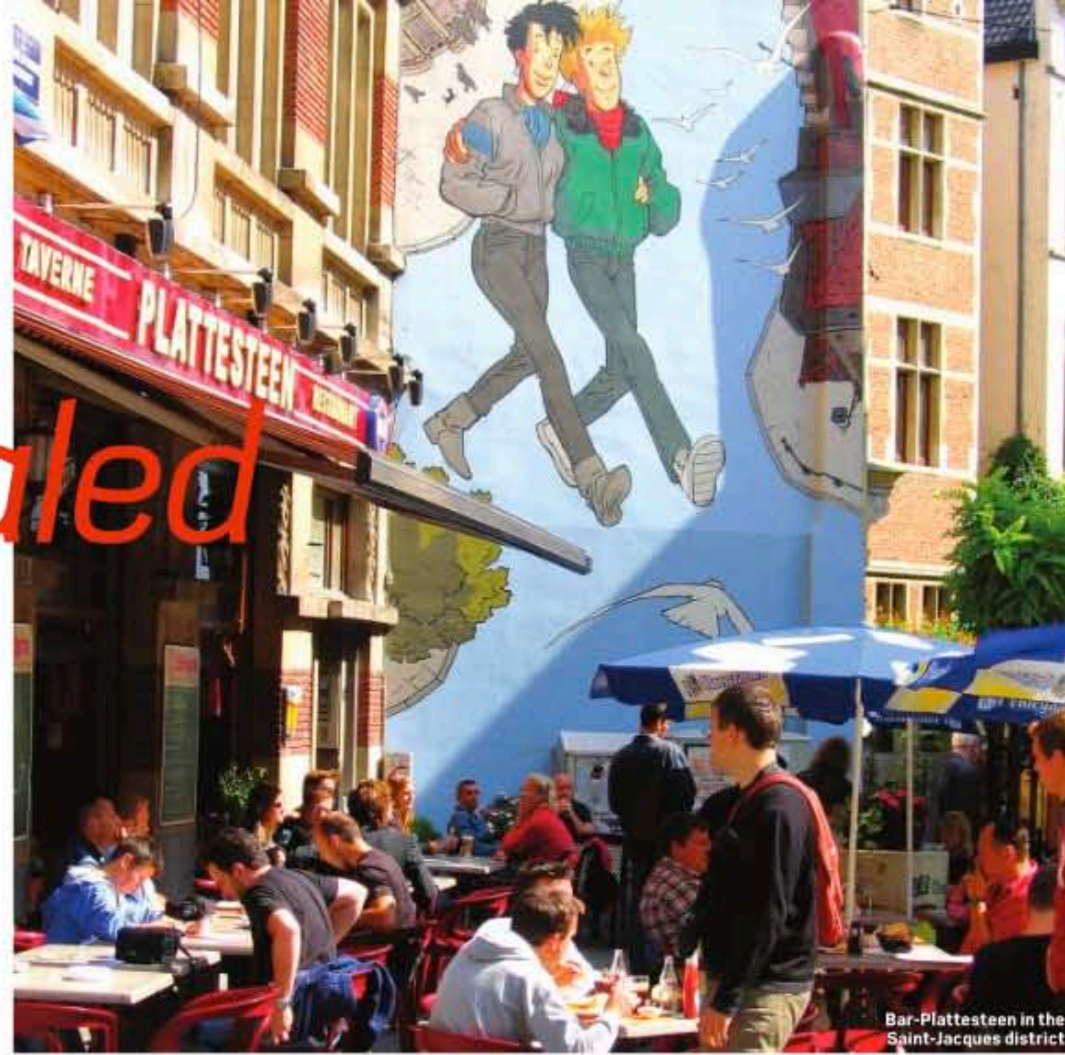
Bar-Plattestein in the Saint-Jacques district