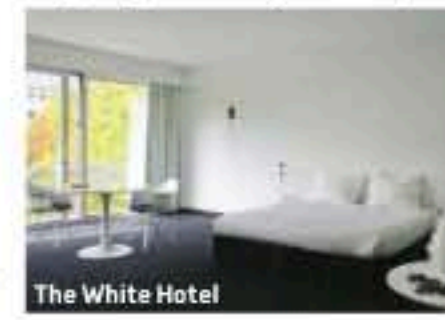
The White Hotel

White (obviously) is the couleur du jour at this cool hotel on Avenue Louise, but what's hot at The White Hotel are the objects by Belgian designers that fill the 53 rooms and common areas. To stamp a little Belgian style on your home, take a look at the hotel's e-shop, where you can buy many of the design accents. thewhitehotel.be