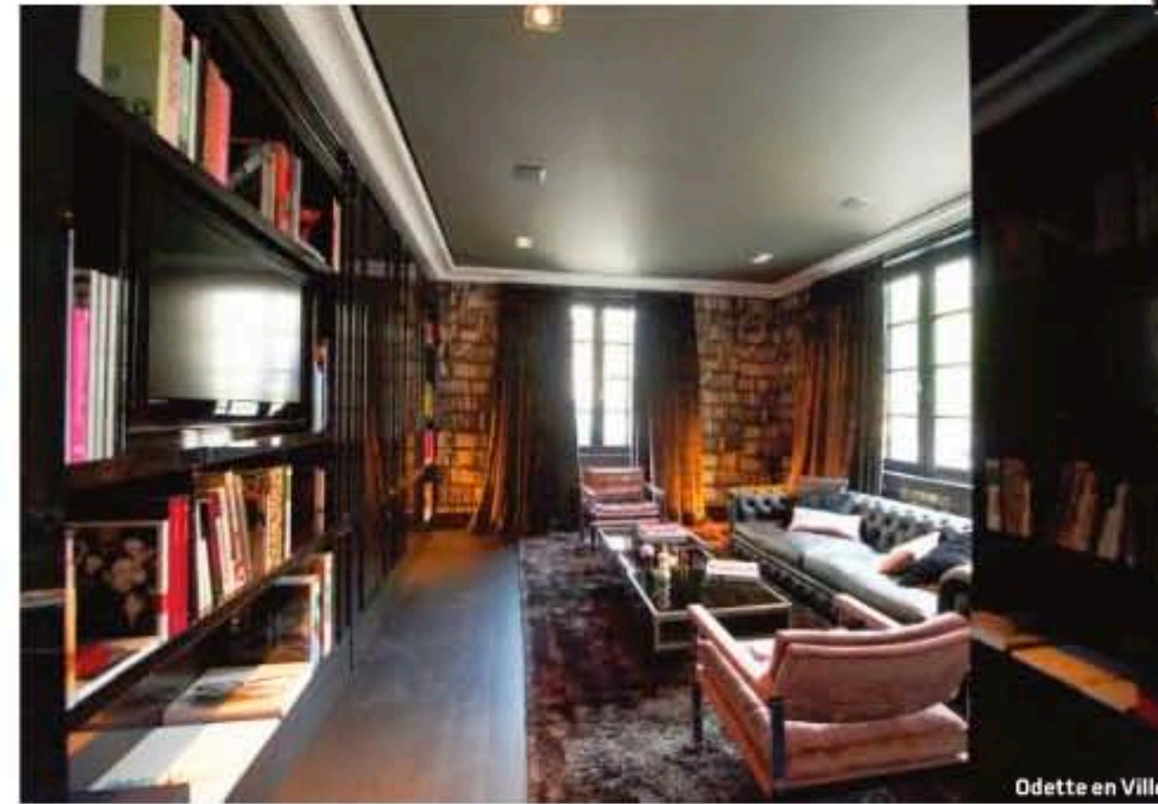
Odette en Ville