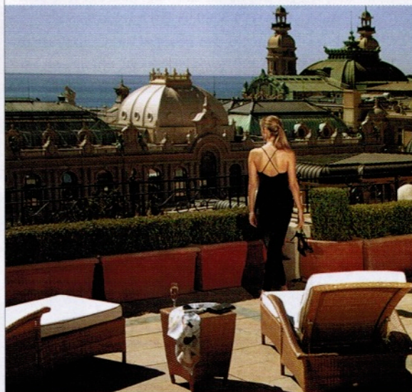
TERRACE OF CARRE D'OR SUITE, HOTEL METROPOLE

around Casino Square. The plush Hotel Metropole (4, Avenue de la Madone; +377 93 15 15 35; metropole.com ) attracts stars of all types, from Hollywood elite (Demi Moore and Ashton Kutcher, in better days) to Michelin stars, three to be exact, at two onsite restaurants, Yoshi and Joël Robuchon (with a third on the way); the hotel's new (June 2012) Karl Lagerfeld-designed pool area is Monaco's latest piscine scene. This summer, the global name in see-and-be-seen, Cipriani (1, Avenue Princesse Grace; cipriani.com ), sets up its first Monte Carlo outpost, sure to be the principality's swankest late-night perch.