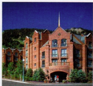
ST. REGIS HOTEL, ASPEN