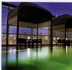
ARMANI/AMAL RESTAURANT TERRACE

ARMANI/AMAL RESTAURANT IN ARMANI HOTEL, DUBAI