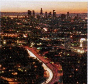
LOS ANGELES SKYLINE

For movie star glamour, celebrity chefs and hang-loose lifestyle,